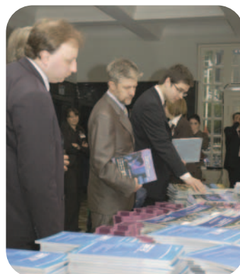
DG Regio exhibition stand

Member states have welcomed Russian and Belarusian partners on board and I am convinced it will be fruitful cooperation. Meanwhile Russia and Belarus have to be more active, so their voices are heard."•