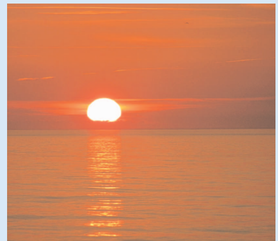
Sunset at the Baltic Sea

Baltic Sea Region INTERREG III B Neighbourhood Programme participates in the MSUO via its projects. New projects can apply for participation in the MSUO following the standard procedures of the main call for proposals. In addition, also ongoing projects can participate through application for a special project upgrade